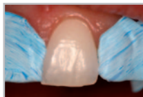
Repeat the same process for the other tooth to be isolated.

Clinical case given by the Group of Dental Studies of Unzibari Brazil - Dental University