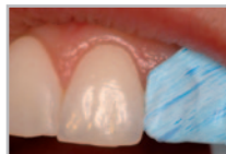
Isolate one tooth.