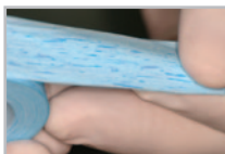
Choose the correct size to isolate one of the adjacent teeth.